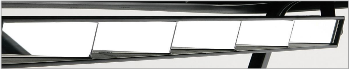
5 Panel Mirror Kit