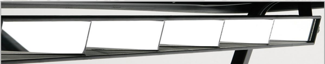
5 Panel Mirror Kit

The Yamaha Over-the-Top Enclosures has been precision engineered for a custom fit for each sun top. Features an over-the-top, trackless style design.